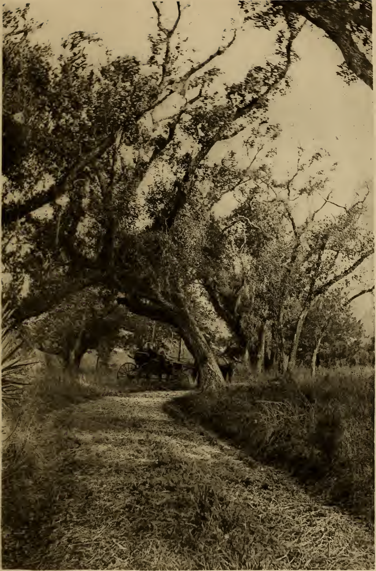
OGLETHORP ROAD NEAR HALF MOON POND